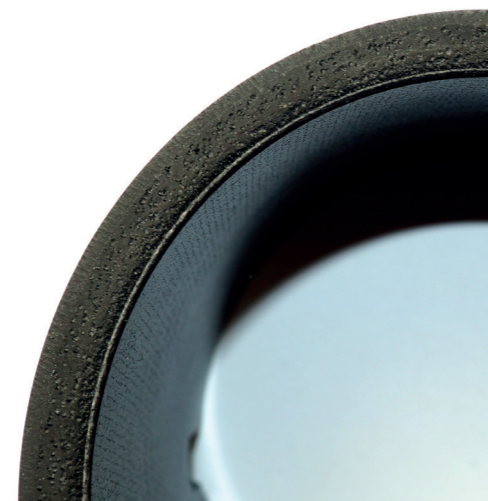
Sleeve with compressible under layer

Beside this, sleeves can be build with different functional under layer. Underneath the 1-3 mm top layer, a soft (40 ShoreA), hard (80 ShoreA) or compressible layer can be build.